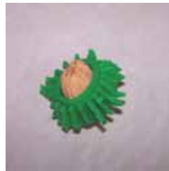
Sunburst wheels; a favorite toy part. You can string them on kabobs, leather, make a foot toy out of them as pictured far left. And when they are all used up, put an almond in the middle and hide it in a toy crock or Zoo Pal cup. Parrots love these. I buy them in bulk from Grey Feather Toys.