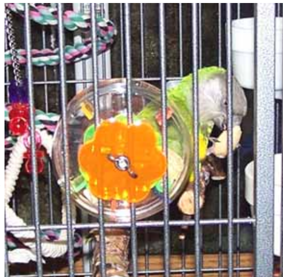
Carrot got a prize almond.