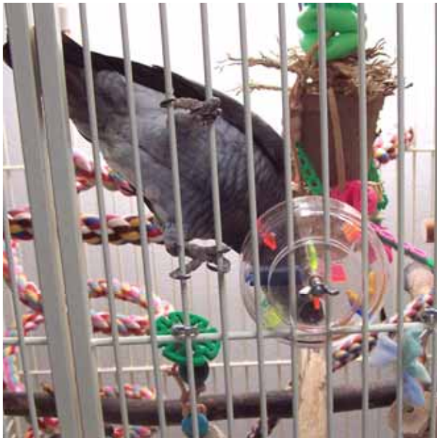
Elvis is after goldfish.

I've noticed with this toy and other foraging toys, that my parrots will be more interested in consuming the food item they retrieve from the toy or they will spend more time playing with an item they have to work to get at.