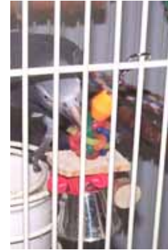
A stainless steel bell base with wood, and beads added for more interest.