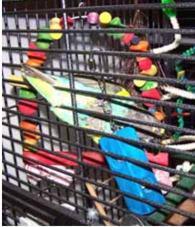
Byrd works at getting an almond out of this block of wood.

Below are more examples of refillable foraging toys that can be purchased on-line or at local pet stores. Most of these treat holders can be found at several on-line sites selling parrot toys.