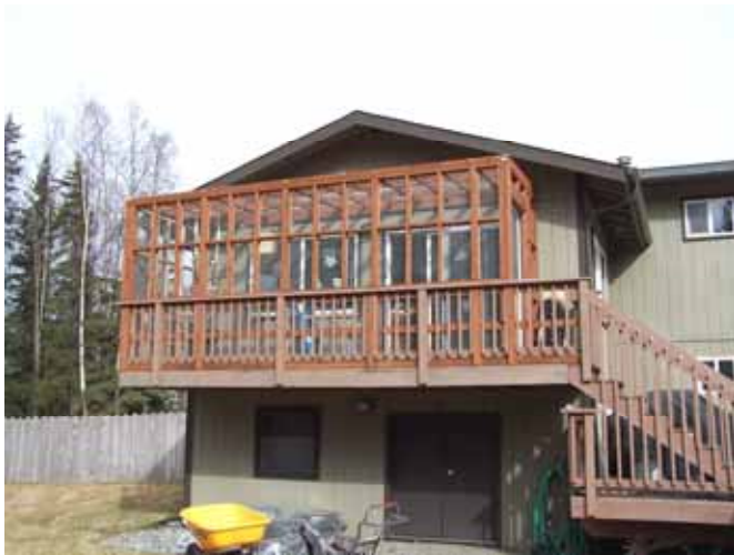
A view from the back of the house.

I have to say Pam is right, this is the single best thing we've done for our parrots. Granted we live in Alaska and our season is short, but we still have plenty of opportunities to get our parrots outdoors. The fact that this aviary is a back porch makes it even more accessible and convenient. I just open the back door and out we go.