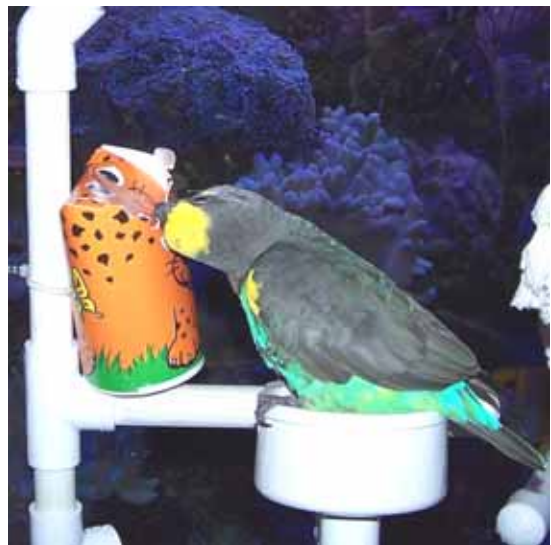
Byrd just wants to shred her cup.