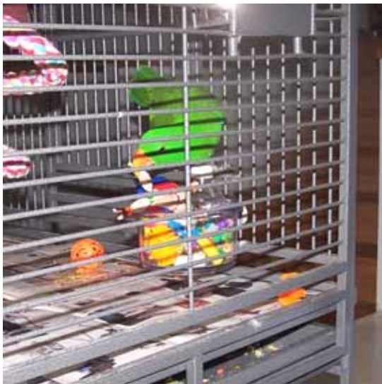
He hunts for buried treasure.