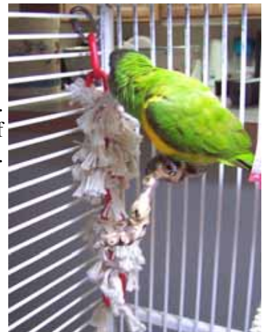
Right you see Carrot with an easy toy to make. A length of plastic chain with short pieces of cotton rope tied all over it.