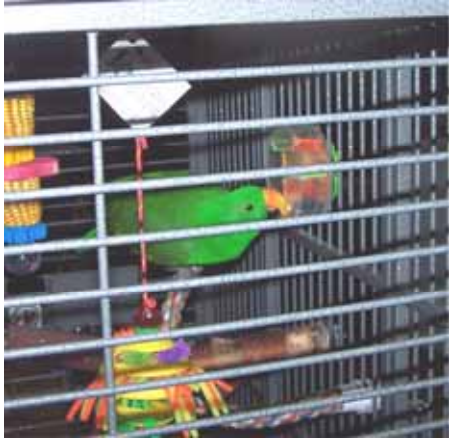
First he gets all the treats.

As you can see in the photos below, Ditto now has something to do in his cage.