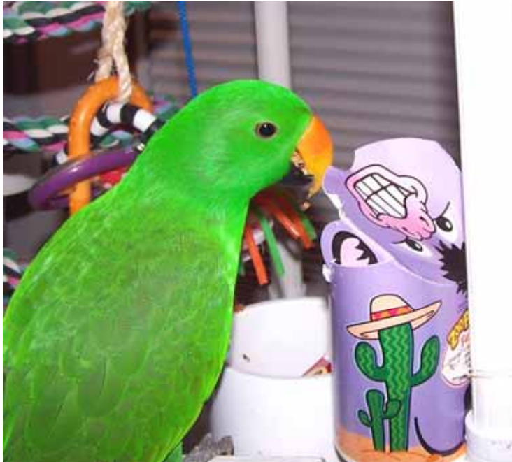
Ditto, seeing what's in his Zoo Pal cup.

I found these Zoo Pal cups at Wal-Mart. Punch 2 small holes in the back of the cup and thread a zip tie through the holes. Then fill cups with edible treats, foot toys and shredded paper. The cups have a lid you can close once you fill them. When filled, tie these cups to the cage bars or on play gym stands. These Zoo Pal cups would also be considered foraging opportunities as your parrots are after food and non-food items that are hidden inside something, and it requires work on their part to obtain the items.