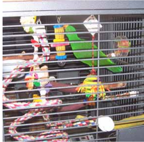
Then he plays with the kabob.