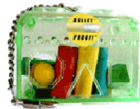
Treasure chests come in two sizes.