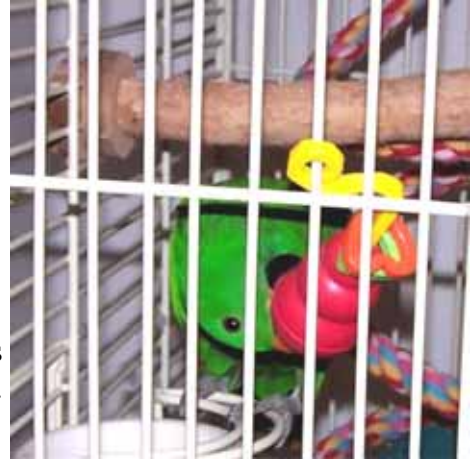
Ditto works for treats hidden in this Kong toy.

Below are pictures of various foraging toys available at on-line sites and local pet stores.