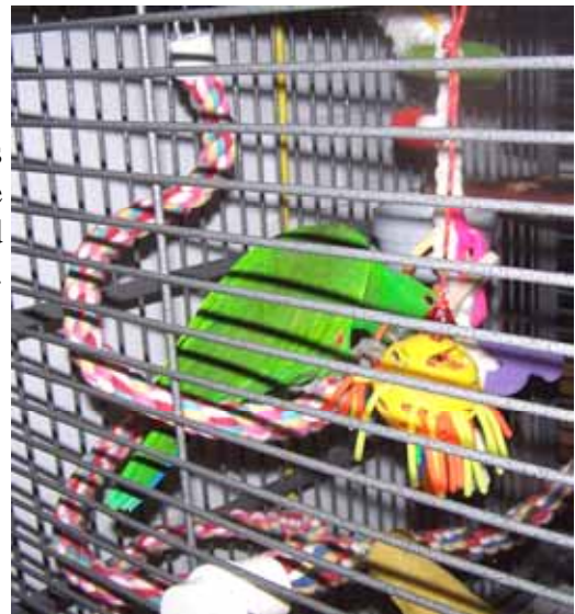
And he plays with the Squid Bungee.

Ditto now has variety, activity, choices to make and problems to solve.