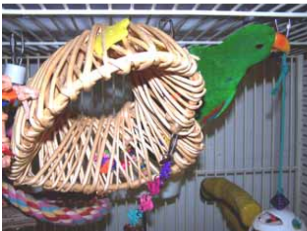
Ditto is on a basket I found at the thrift store. I put buttons, beads and squish balls inside the basket weavings and hung it in the cage with a quick link.