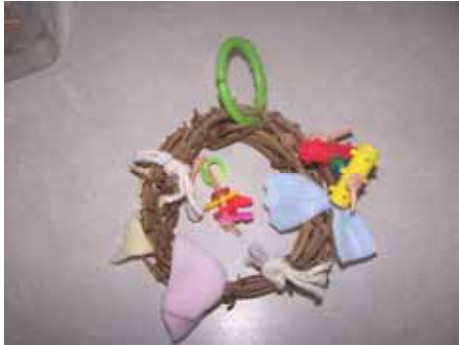
This is a grape wreath purchased at Michaels made more interesting by adding leather, beads, polar fleece & cotton rope.